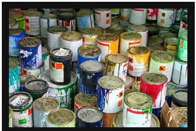
Make sure your paint cans have tightly-closed lids and that the labels are legible when you bring them to a participating PaintCare retailer

87 Quinnipiac Ave North Haven , CT 06473 (203) 776-6256